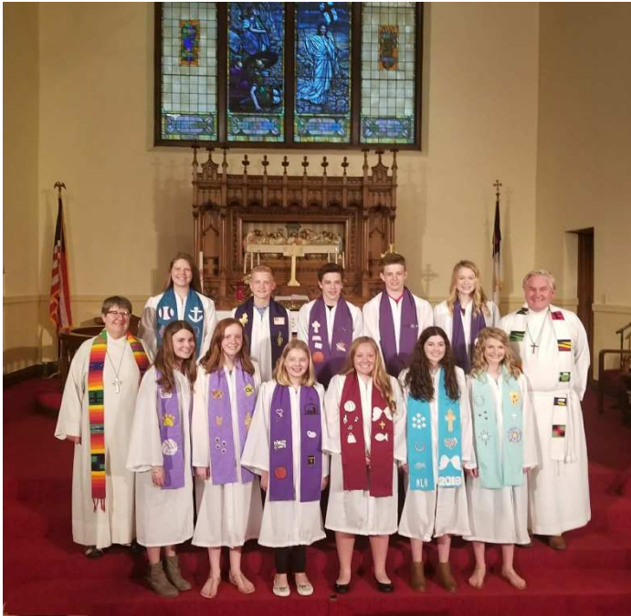
Congratulations to the 2018 Confirmands